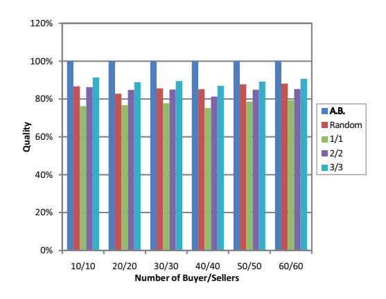
Figure 2. Mean Solution Quality Experiment A

60/60 scenarios to nearly 47 which is 94 percent. For all of these problem instances the execution of the solver has been cut off after 180 seconds. In comparison none of the greedy approaches required on average more than 4.6 seconds to compute a solution. The results for the solution quality show that none of the greedy approaches matched the solution of the analytical benchmark solution. In comparison of the greedy approaches the 3/3 algorithm performed best delivering on average 90 percent of the solution quality of the analytical benchmark solution. The 2/2 approach performs similar to the random strategy but requires more computational effort. The 1/1 approach requires a higher computational effort than the random algorithm delivering a results of inferior quality.